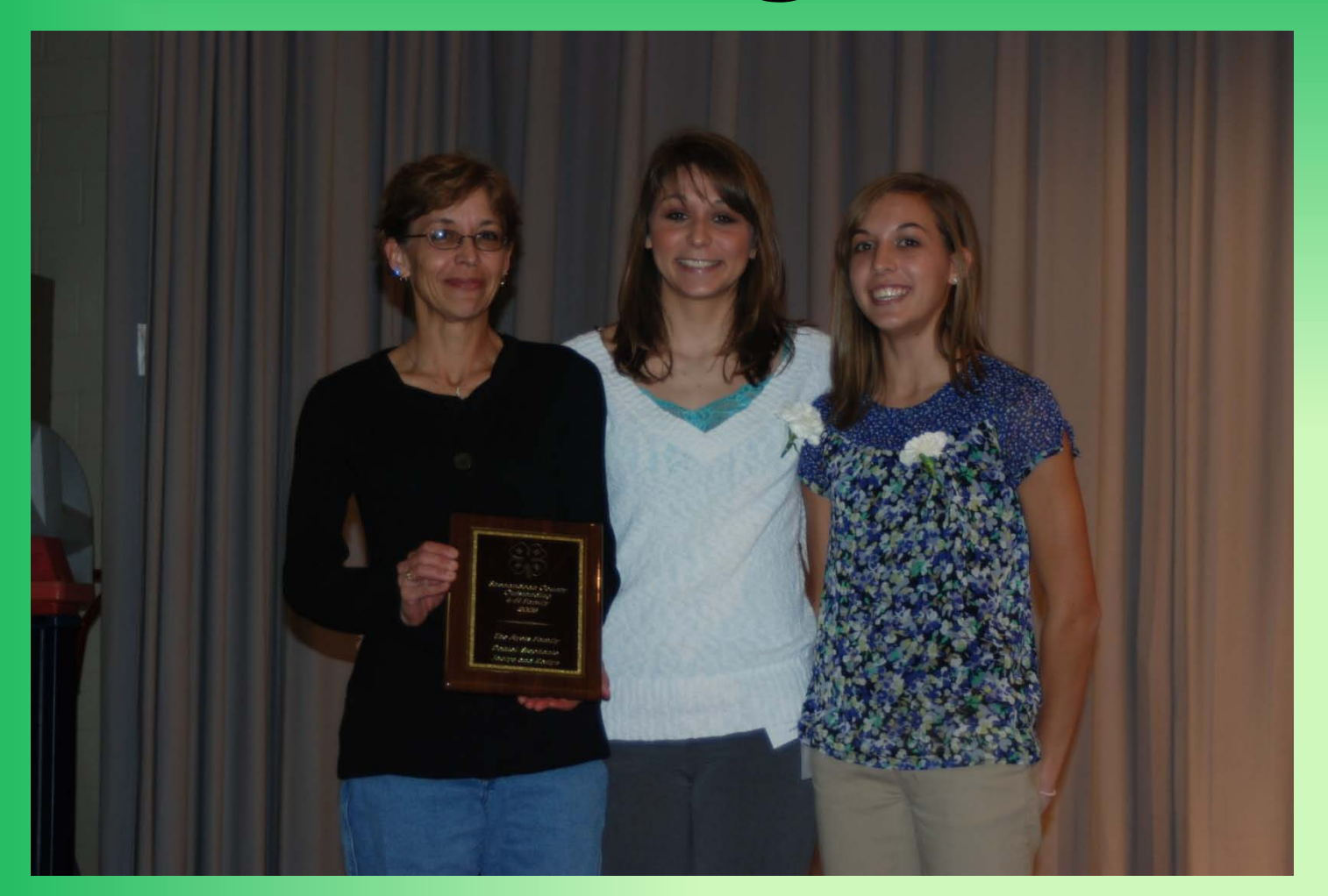
The Ayers Family