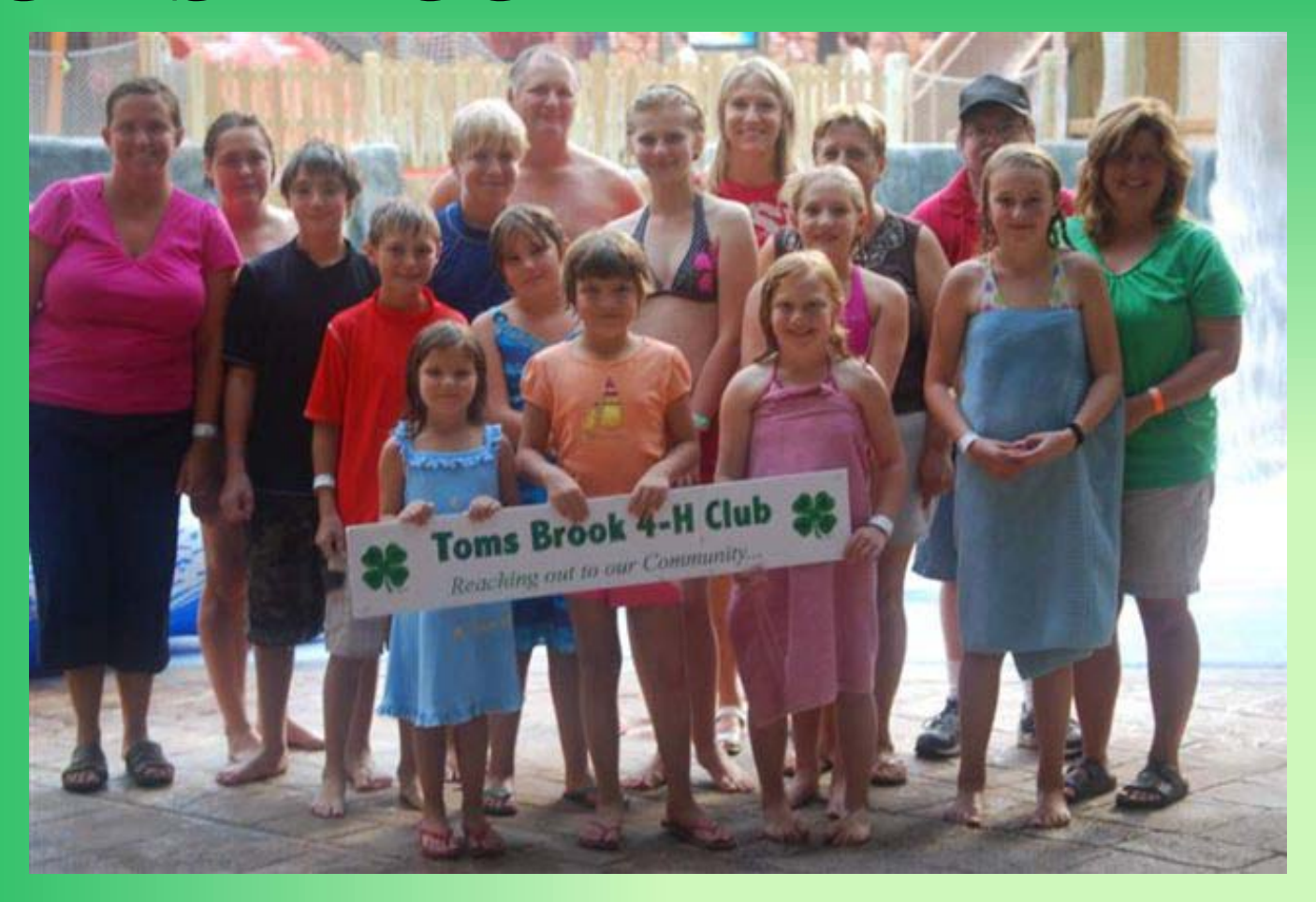
Taking time to have fun!