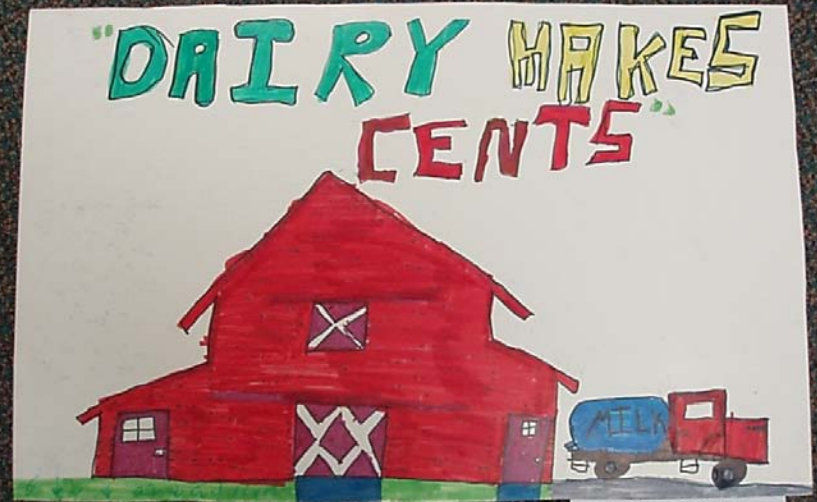
Andrew Rhodes Intermediate – 1 st Place Toms Brook 4-H Club 2 nd Place in State!