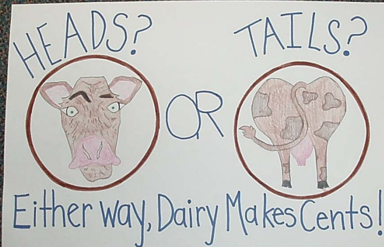
Katelin Kline Senior – 1 st Place St Luke-Saumsville 4-H Club 2 nd Place in State!