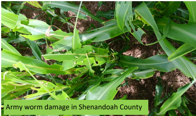
Army worm damage in Shenandoah County