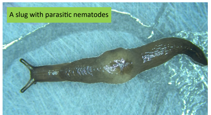
A slug with parasitic nematodes

Certification Credits Available for Pesticide Applicators, Nutrient Management, and Certified Crop Advisors!!