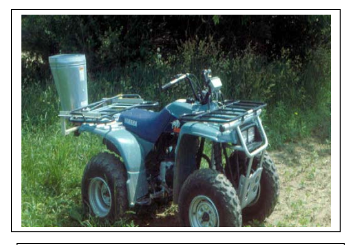
Figure 3: Typical Spreader Used for Slug Bait

Management: If you have a stand loss, the decision becomes the need to replant. It is beyond the scope of this information sheet to discuss this need, other than to refer you to Agronomic Guidelines. However, because the slugs are probably still present after replanting, a molluscicide treatment <u>may be</u> warranted.