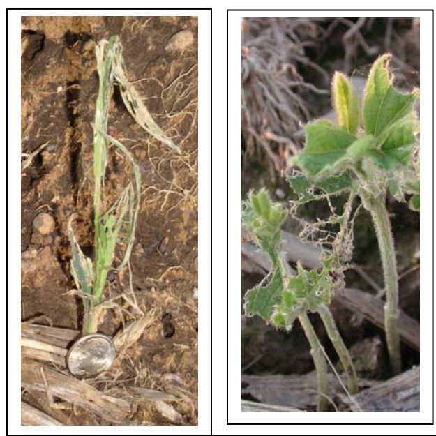
Figure 1: Slug Damage to Corn and Soybean

Damage to Corn: On field crops such as corn and soybean planted in the spring, the most severe injury, leaf feeding, is caused by large populations of juvenile slugs in late May and early June. Following egg hatch in mid-to-late May or early June, the juveniles begin to cause significant injury. Populations as high as 8-10 juvenile slugs per single corn plant have been seen. Injury causes a loss of vigor resulting in stunted, lower yielding plants, and if severe, can lead to death of the plant and stand losses. So far, we have not observed significant damage from adult gray garden slugs compared with the shear numbers of heavily feeding juveniles to field crops in the spring.